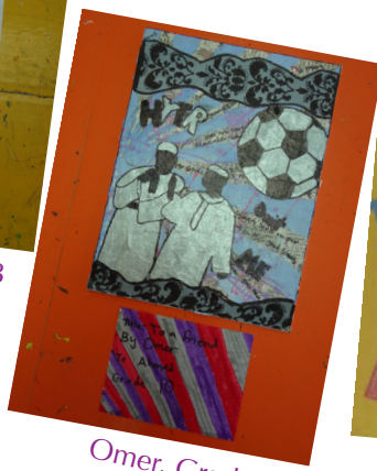
Omer, Grade 10