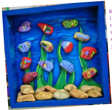
K i n d e r g a r t e n